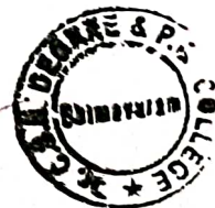
PRINCIPAL Dr. C.S.N. DEGREE & P.G. COLLEGE BHIMAVARAM.